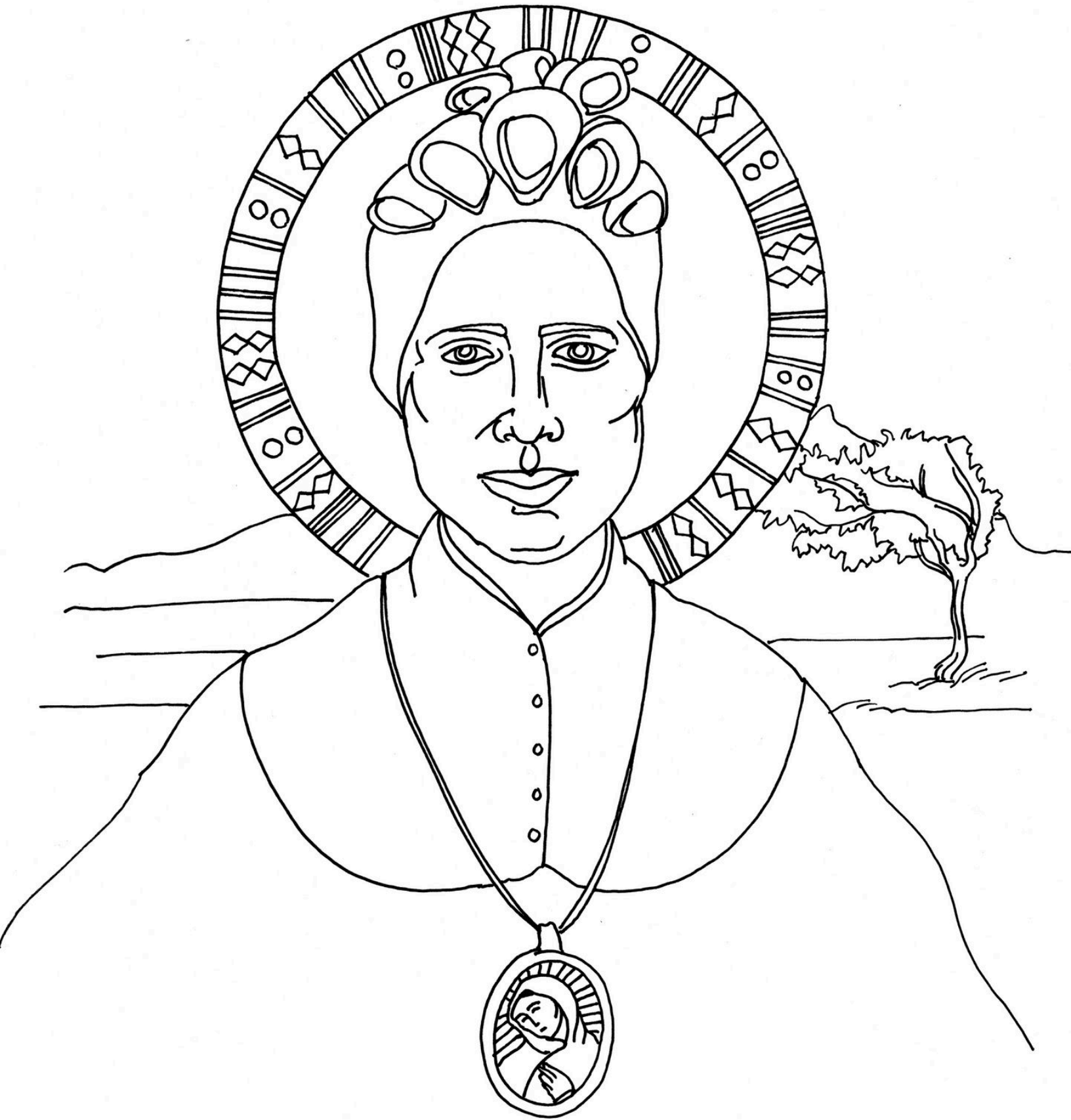
Saint Josephine Bakhita * February 8